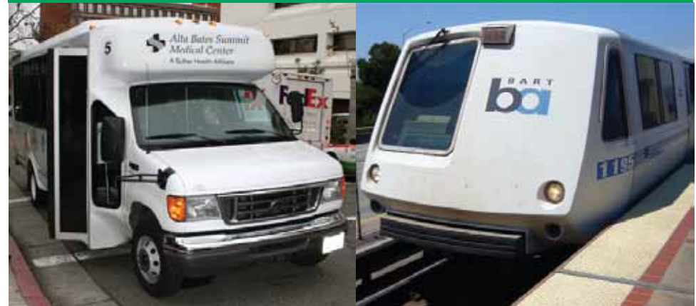
Alta Bates Summit Medical Center Parking and Transportation Department